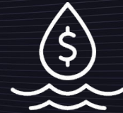
Liquidity & Yield Farming