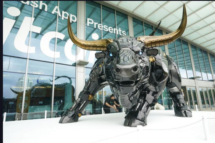
Miami Bull Statue