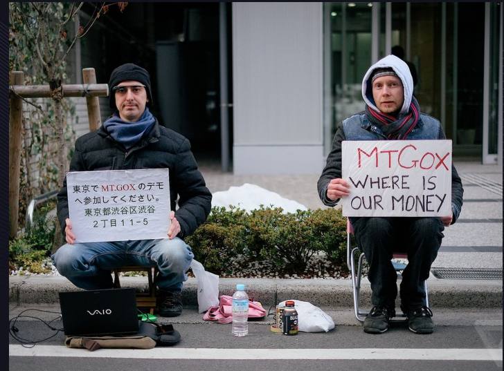
2014 Mt. Gox Victims